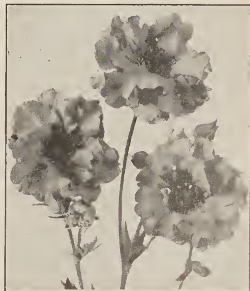
Geum, Mrs. Bradshaw

SIBIRICUM. Dwarf variety with reddish orange flowers, 9-10 inches.